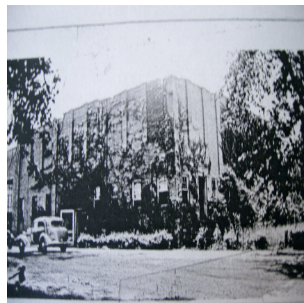
ICP circa 1940

Today – ICP manufactures a diverse range of products for the metalcasting industries in our 110,000 sq. ft. manufacturing and technical facilities. Approximately 15% of production is exported with customers worldwide including China, India and Mexico. ICP also imports and distributes complimentary products.